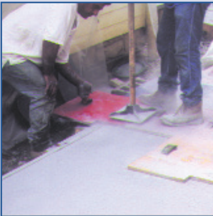
3. Tamp in Texture Mats.

Wall Hugger “Floppy” Mat - A flexible mat with grout lines that bends to reach tight areas.