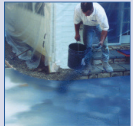
2. Apply Release Agent.