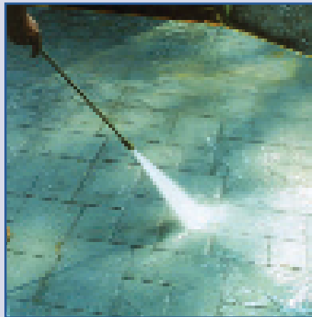
4. Remove excess Release Agent.