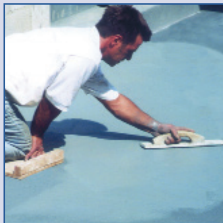
1. Finish concrete following normal practices, using Bon True Color™ Hardener or Ironox™ Integral Color.